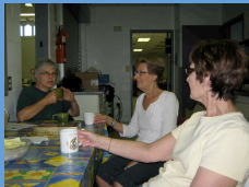
The gals are taking a much needed break!