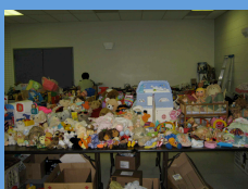
Toys, toys, toys!