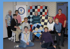
Displaying the finished product.

HERE ARE SOME PHOTOS OF OUR HAPPY QUILTERS!